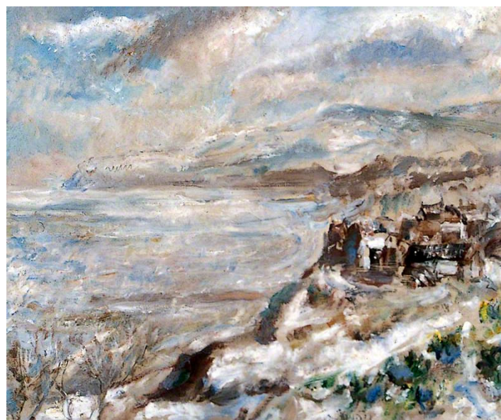
Robin Hood's Bay in Winter

'when she returned to Robin Hood's Bay during the summer of 1935 she painted those wonderful sea pieces, miraculous evocations of the fleeting evanescent moods of sea and sky such as "An Autumn Morning".'