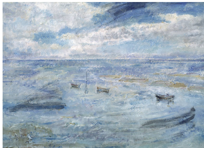
Seascape—"An Autumn Morning"

A view of Robin Hood's Bay, the favourite haunt of the artist who owned a fisherman's cottage above the cliffs overlooking the sea where this may have been painted in the autumn of 1935.